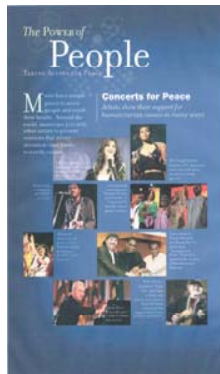
Exhibit Opening Program

“Music can change the world because it can change people.” Bono